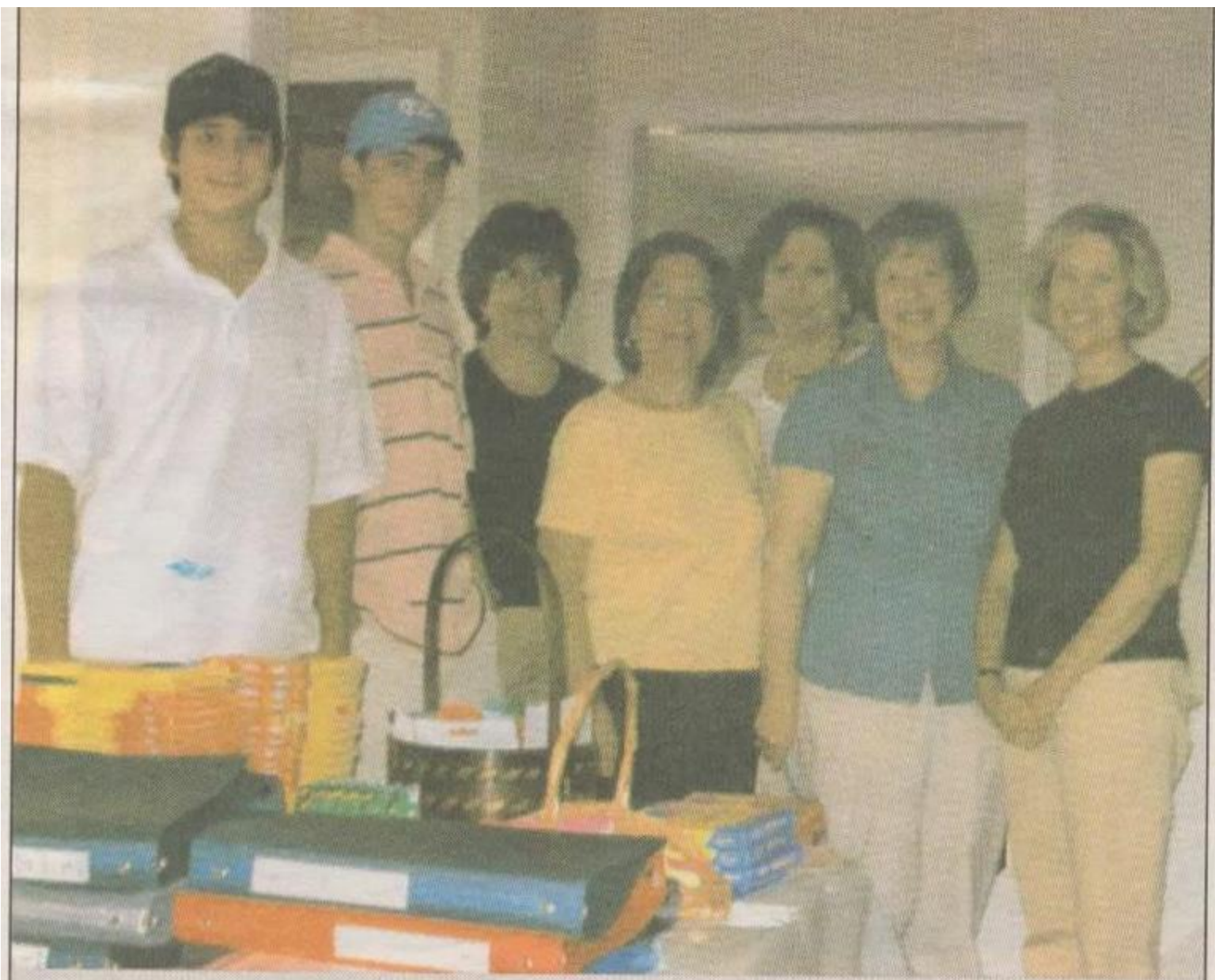
JCSO donates school supplies