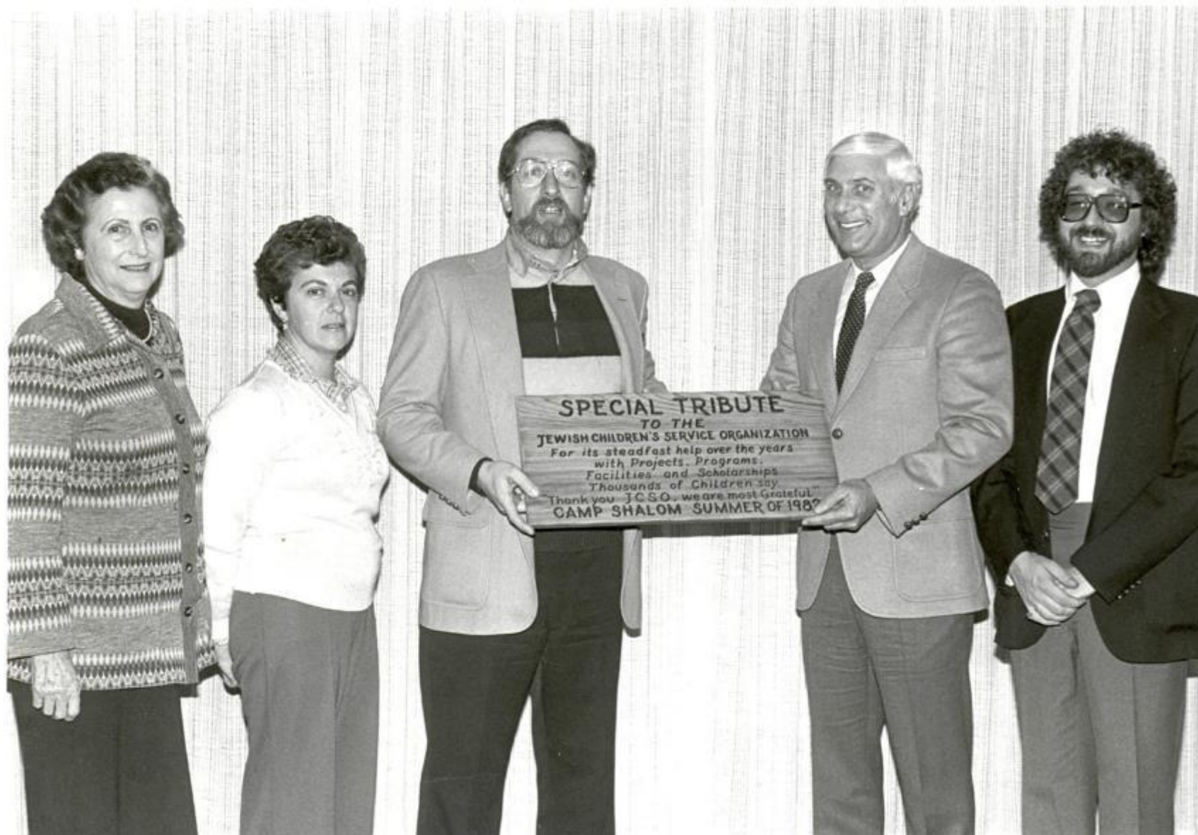
Camp Shalom tribute to JCSO 1981-1982