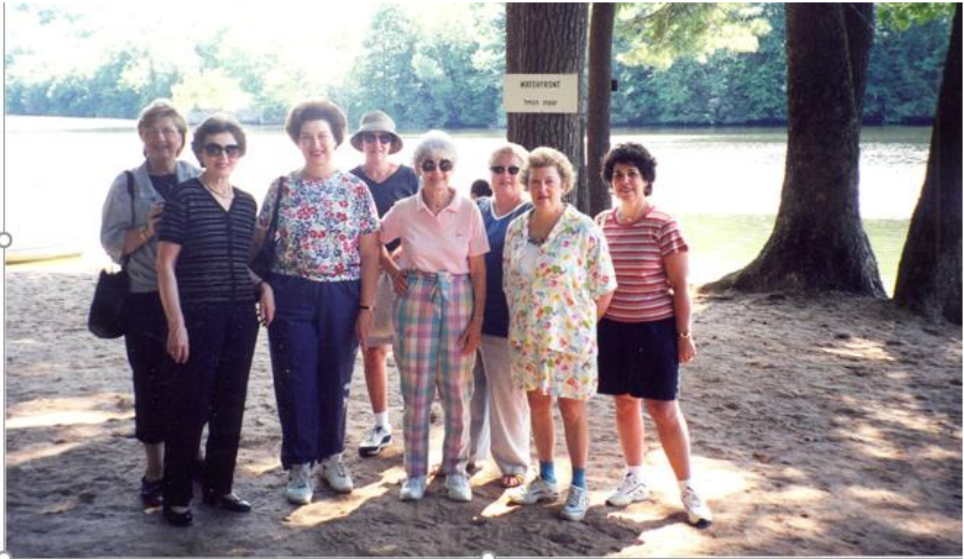
Camp Shalom 1999