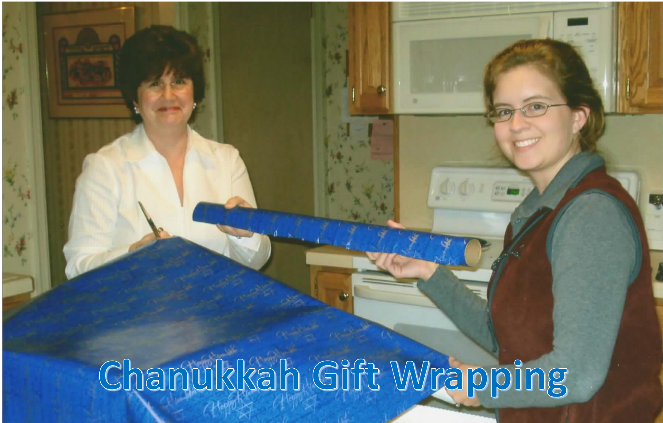
Chanukkah Gift Wrapping