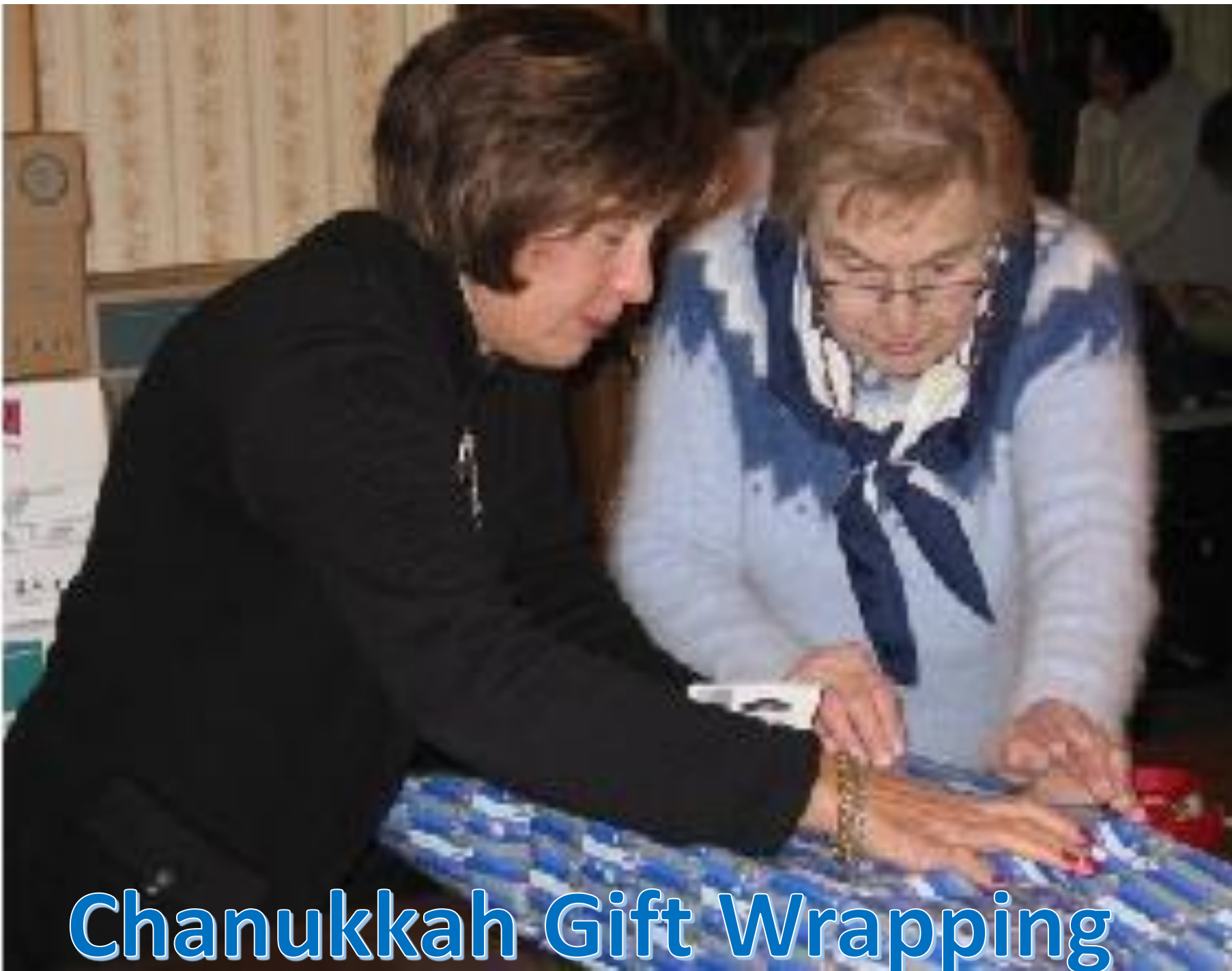
Chanukkah Gift Wrapping