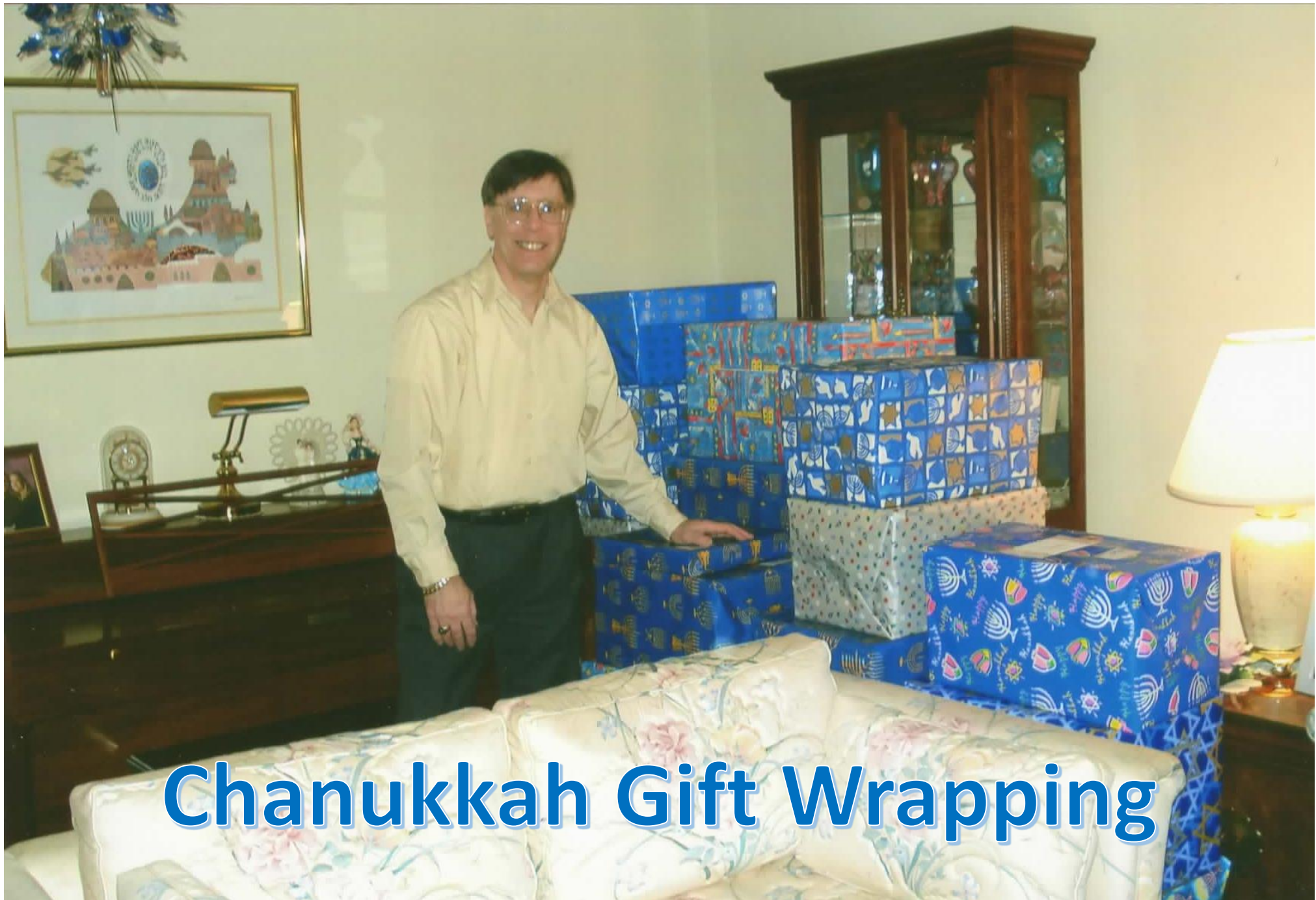
Chanukkah Gift Wrapping