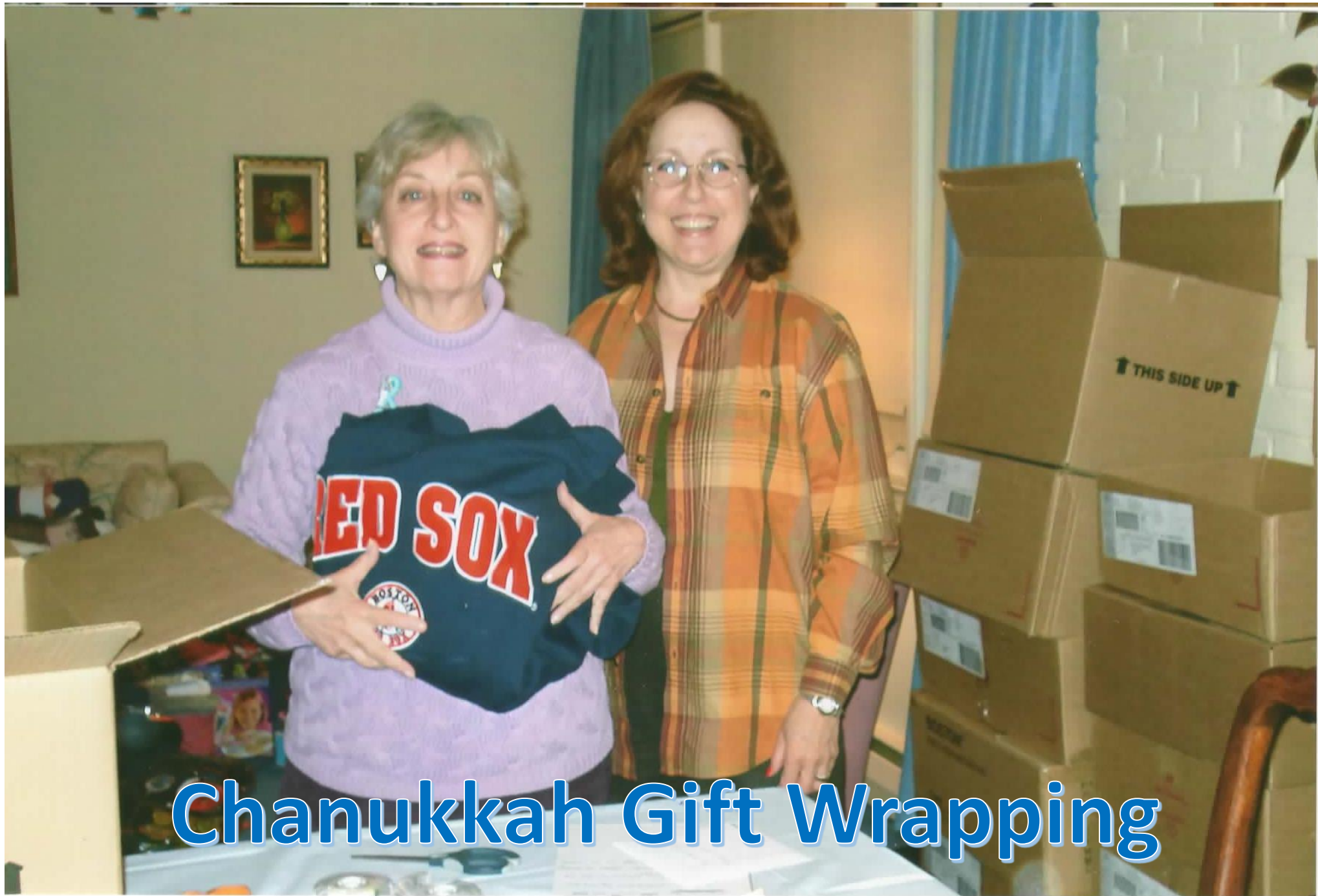
Chanukkah Gift Wrapping