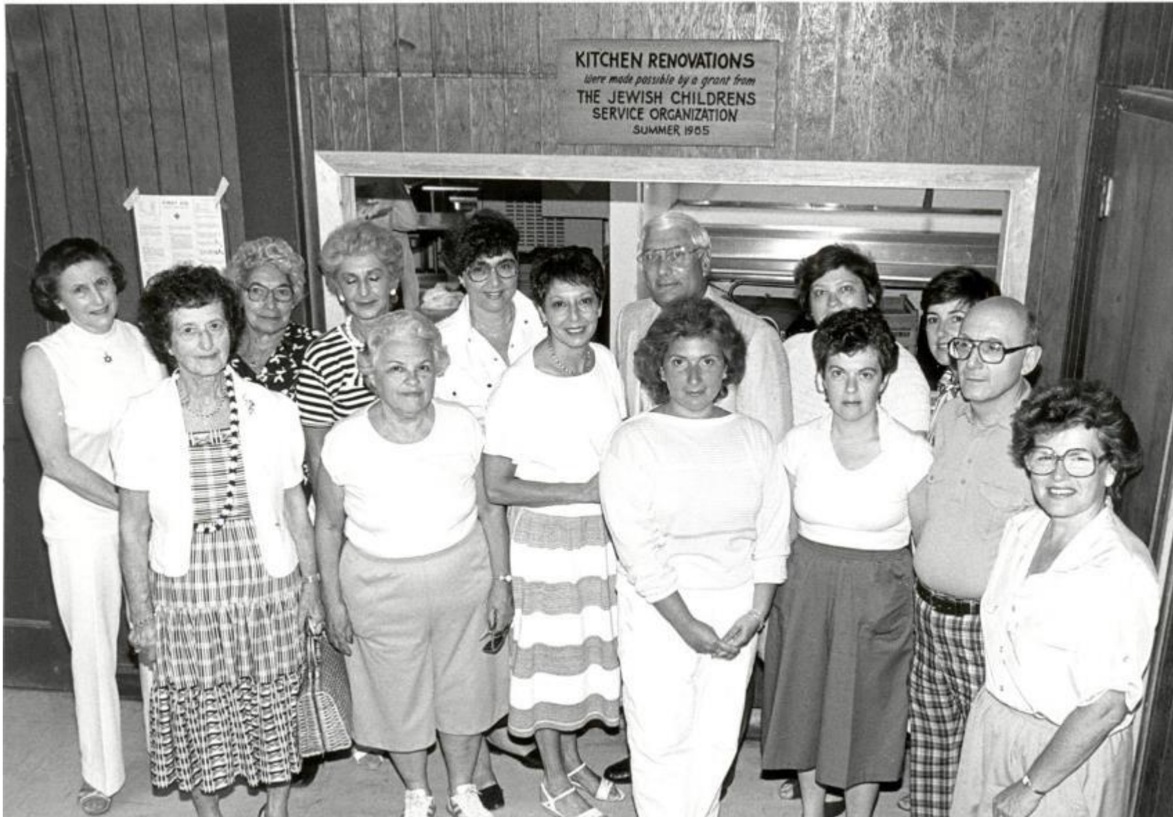
Past Presidents at Camp Shalom 1985