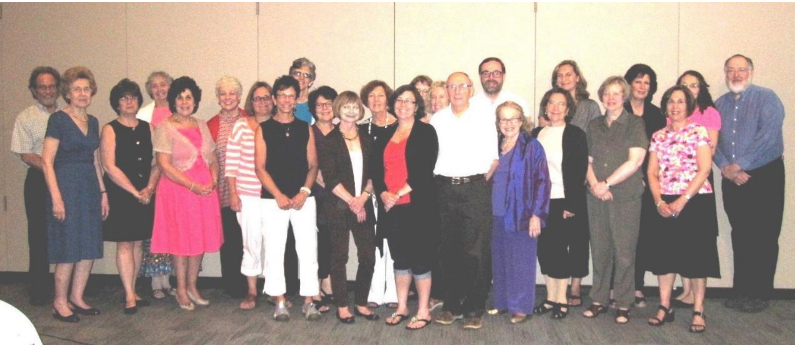
JCSO Board 2013