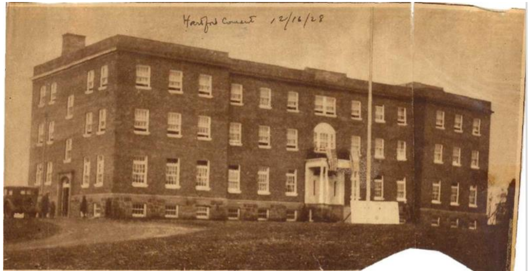
New Hebrew Women's Home for Children – Corner Blue Hills and Tower Avenues, Hartford 1928