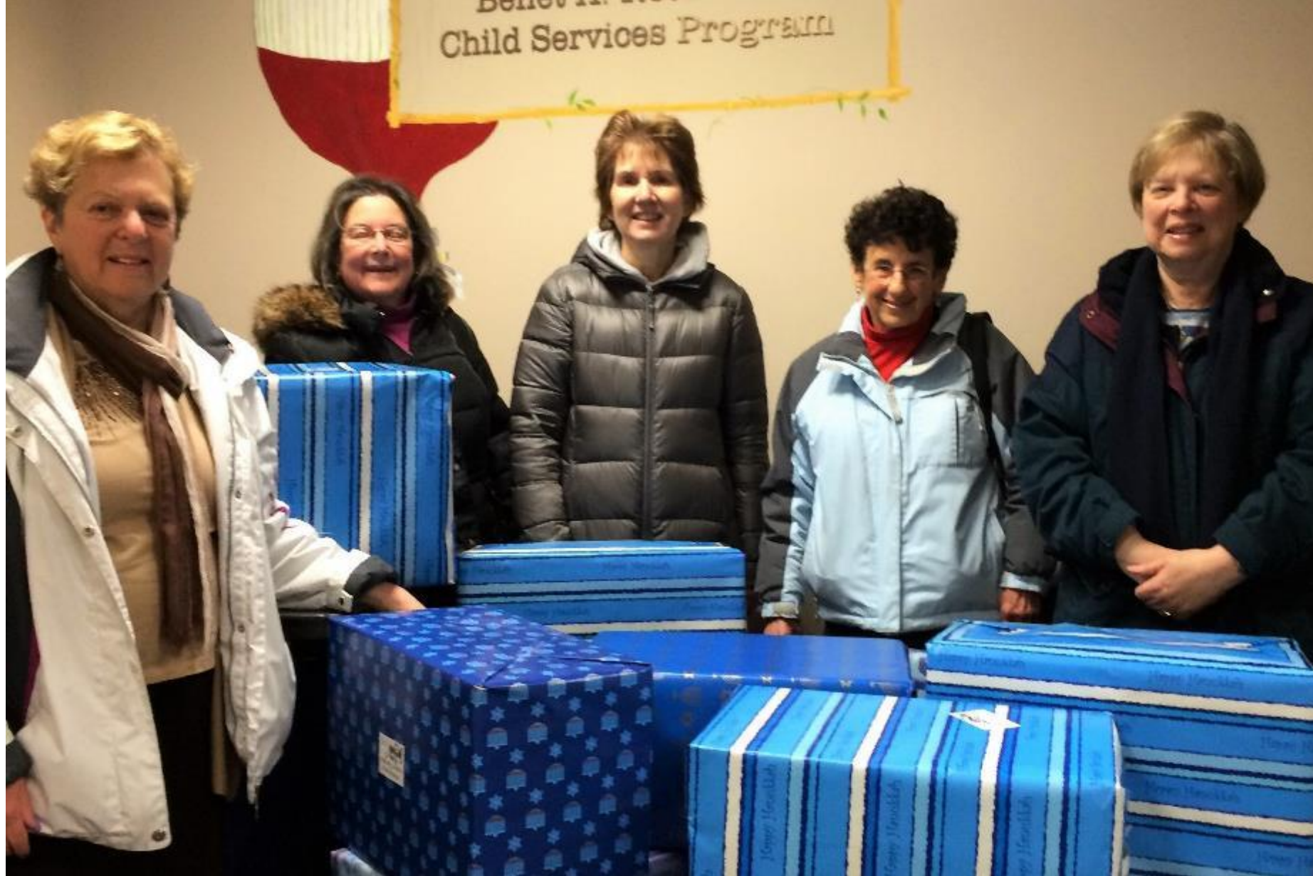
Delivering Chanukkah gifts to JFS 2016