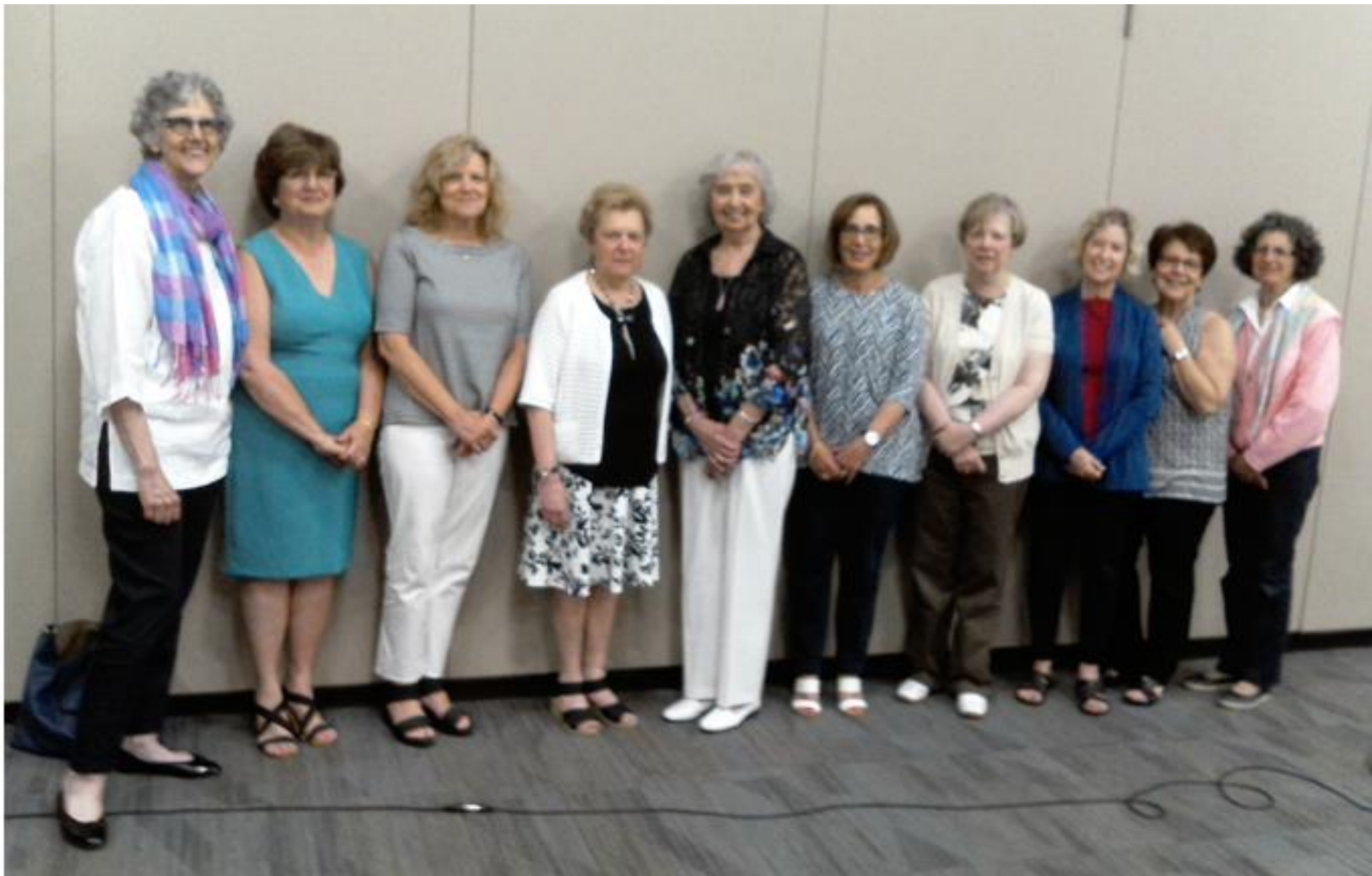
JCSO Executive Board May 2017